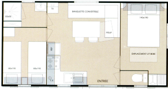
Mobil home 28 m 2 with a semi covered terrace